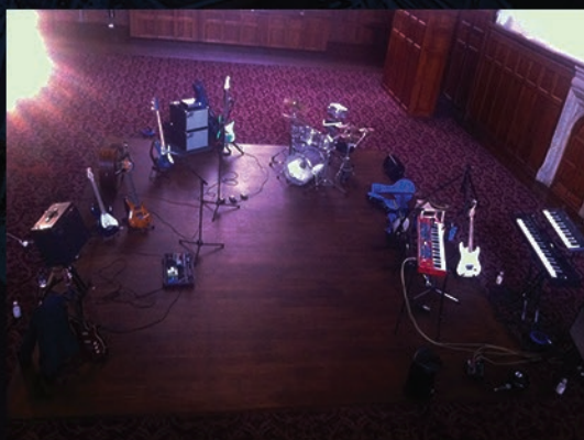
Live Band Rehearsal Setup - Dec 2014